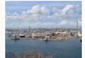
Port safety and security operations