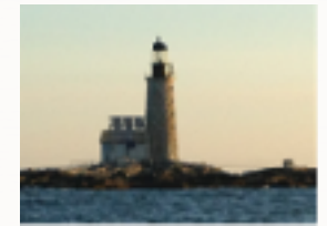
Plotting a track line around shoals to safe operations