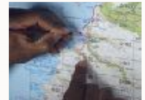
Risk identification and mitigation