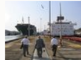
Vessel regulatory compliance

Whether it is traditional ship and port operations, or large scale infrastructure development, The Paratus Group can help make your operations more efficient. With experience in the licensing and construction of America's first offshore wind energy project, we can also help you navigate regulations and best practices as you break new ground with novel projects and disruptive technology.