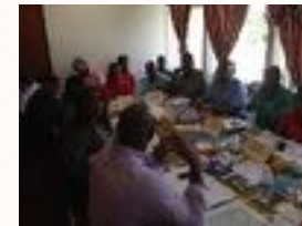
Training and workshops

The Paratus Group consultants bring years of experience and have literally written the international manual on emergency preparedness. We specialize in contingency planning and training for executive leaders and first responders alike. We bring years of experience conducting post-casualty investigations to help you prevent and mitigate incidents that disrupt your business.