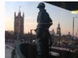
Finding opportunity in emerging regulations

Keeping track of developing international regulations and ensuring compliance with existing regulations is no easy task. The Paratus Group can help you ensure you are meeting all your requirements, whether you are an IMO member state or a facility wanting to follow industry best practices. Use our knowledge of the forces affecting tomorrow's shipping to your advantage.